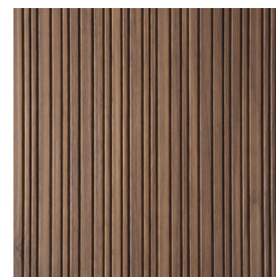
Heartwood walnut Real wood veneer