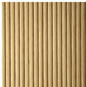
Knob oak Real wood veneer

Straightness: 3,0 mm per Meter Size accuracy: +/- 1,0 mm per Meter Thickness allowance: +/- 0,5 mm Exactitude of profile: +/- 1,5 mm