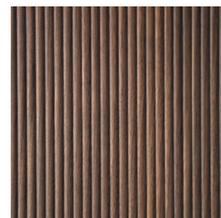
Heartwood walnut Real wood veneer