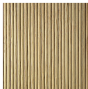
Knob oak Real wood veneer

Straightness: 3,0 mm per Meter Size accuracy: +/- 1,0 mm per Meter Thickness allowance: +/- 0,5 mm Exactitude of profile: +/- 1,5 mm