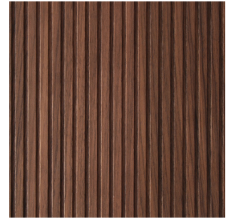
Heartwood walnut Real wood veneer