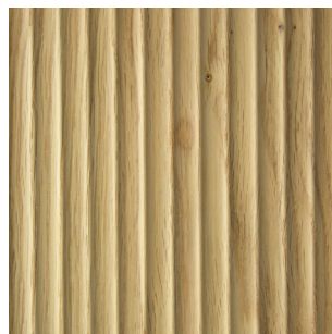
Knob oak Real wood veneer

Straightness: 3,0 mm per Meter Size accuracy: +/- 1,0 mm per Meter Thickness allowance: +/- 0,5 mm Exactitude of profile: +/- 1,5 mm