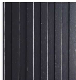
Black Fineline veneer