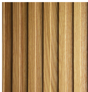
Knob oak Real wood veneer