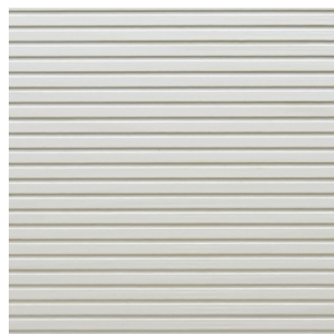
White Alpi veneer