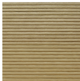
Knob Oak Real wood veneer