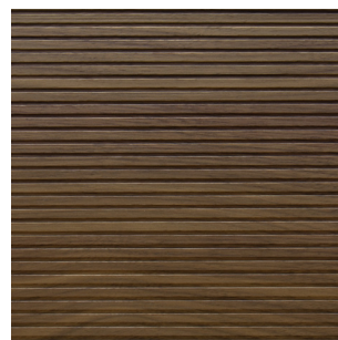
Heartwood walnut Real wood veneer