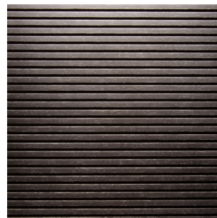
Black Alpi veneer