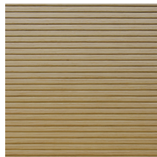
Light Oak Alpi veneer