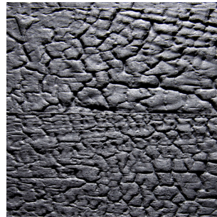
Black Fineline veneer

Straightness: 3,0 mm pro Meter Size accuracy: +/- 1,0 mm pro Meter Thickness allowance: +/- 0,3 mm Exactitude of profile: +/- 1,5 mm