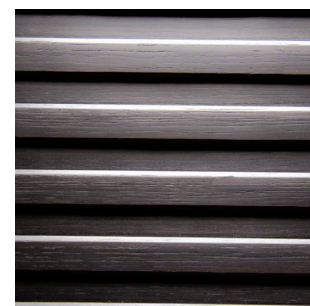
Bog Oak Real wood veneer