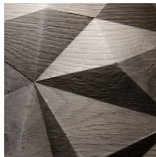
Oak grey Real wood veneer