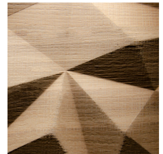
Oak nature Real wood veneer