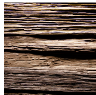
Walnut antique Real wood veneer