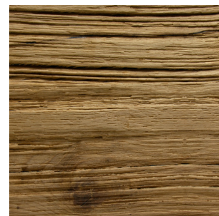
Old Oak Fineline veneer