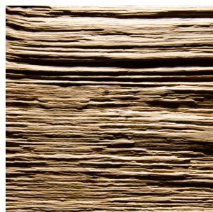
Knob Oak Real wood veneer