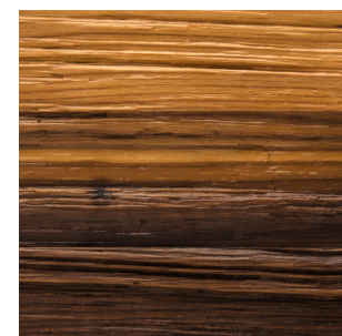
Larch smoked Real wood veneer