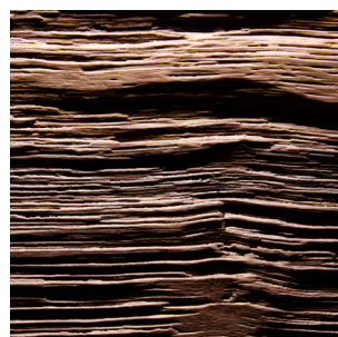
Heartwood walnut Real wood veneer