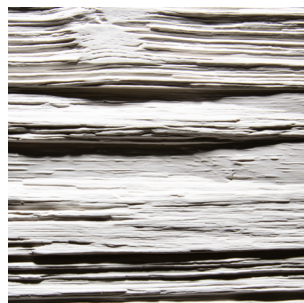
White Fineline veneer

Straightness: 3,0 mm per Meter Size accuracy: +/- 1,0 mm per Meter Thickness allowance: +/- 0,5 mm Exactitude of profile: +/- 1,5 mm