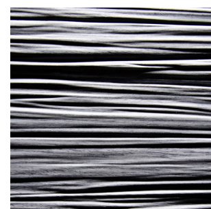
Grey Alpi veneer