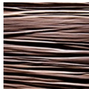
Heartwood walnut Real wood veneer