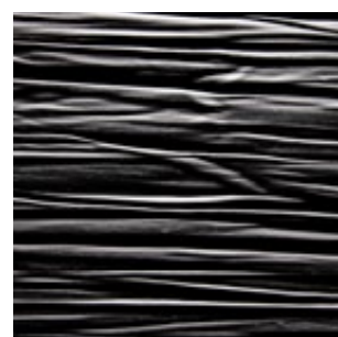
Black Alpi veneer