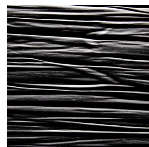
Black Alpi veneer