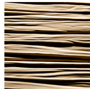
Heartwood Ash Alpi veneer