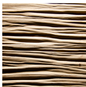
Knob Oak Real wood veneer