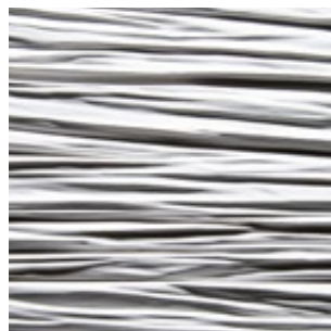
White Alpi veneer