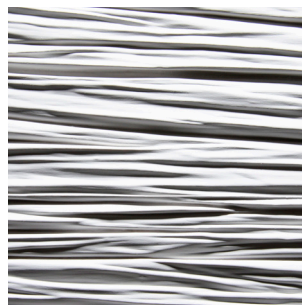
White Alpi veneer