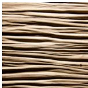
Knob Oak Real wood veneer