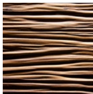
Larch smoked Real wood veneer